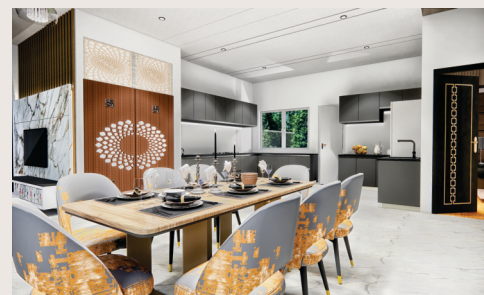
DINING & KITCHEN