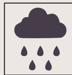
Rain water harvesting