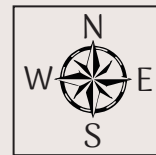
Vaastu Complaint Homes

When the entire concept of the project is draped in style and superior aesthetics, the homes surely cannot take a different path. Oozing opulence from every pore are stunningly beautiful residences, lavishly laid out and appointed with pinpoint detailing and an attention to detail that would make any designer proud.